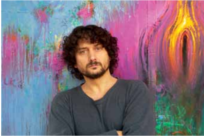
The artist pictured in his studio, in front of Well 23 – Brimo , 2013